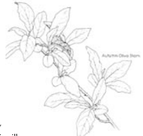
Autumn Olive Branch