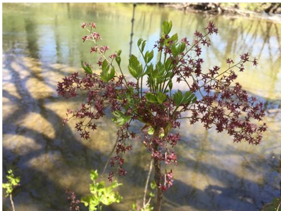
Yellowroot