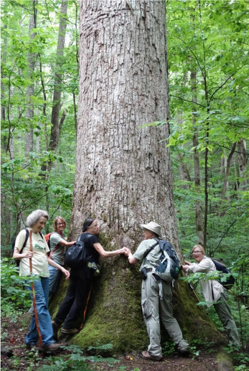
Group tree hugging - photo by Sue Harmon

A second chance to sign up: This hike filled quickly, so we are offering another opportunity!