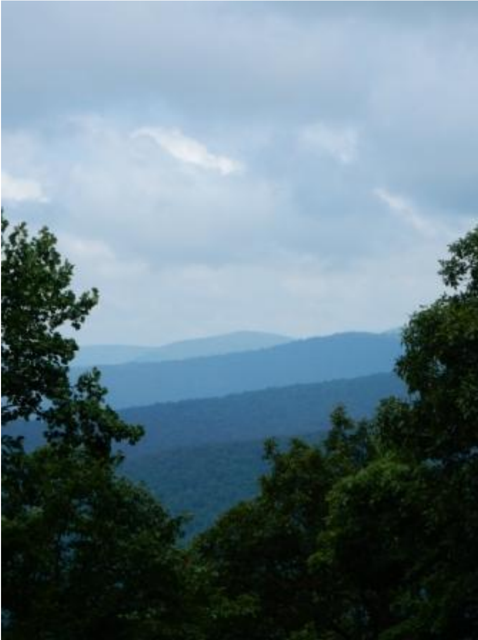
View West from Sassafras Mountain