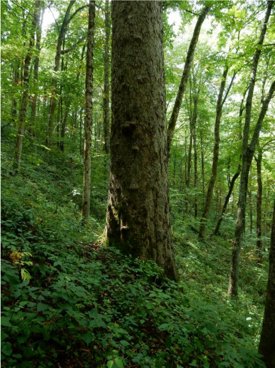
Yellow Buckeye - Photo by Jess Riddle