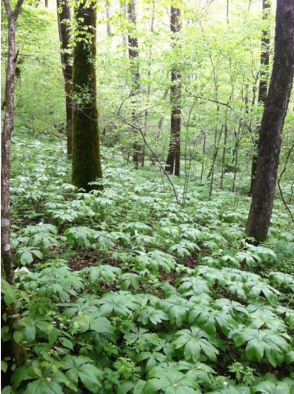
Tennessee Rock Trail