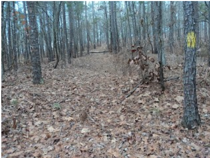
photo of the old roadbed