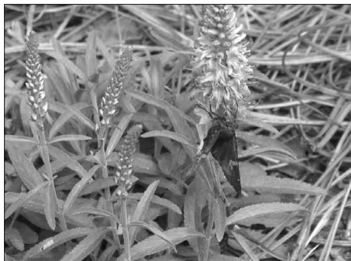
Skipper butterfly on speedwell